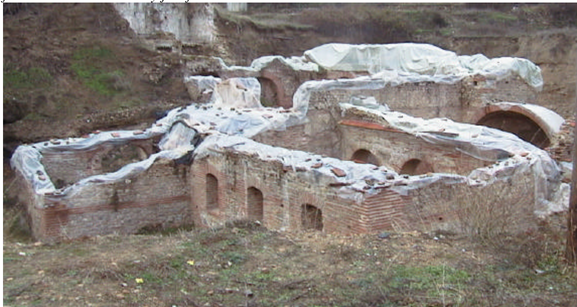
Fig.2. Ruins of the Roman Bath in Bansko – Strumica

of recreational activities looks as one of the feasible and economically justified solution.