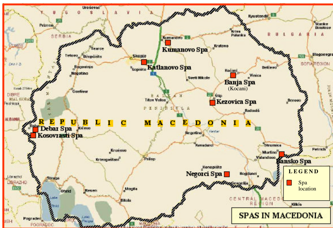
Fig. 1. Location of the spas in Macedonia

Geothermal Association of Macedonia – MAGA