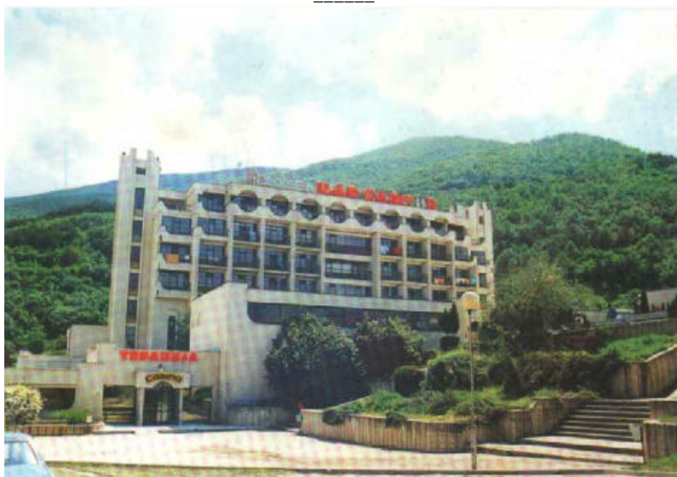
Fig.9. Hotel “Tsar Samuil” in Bansko